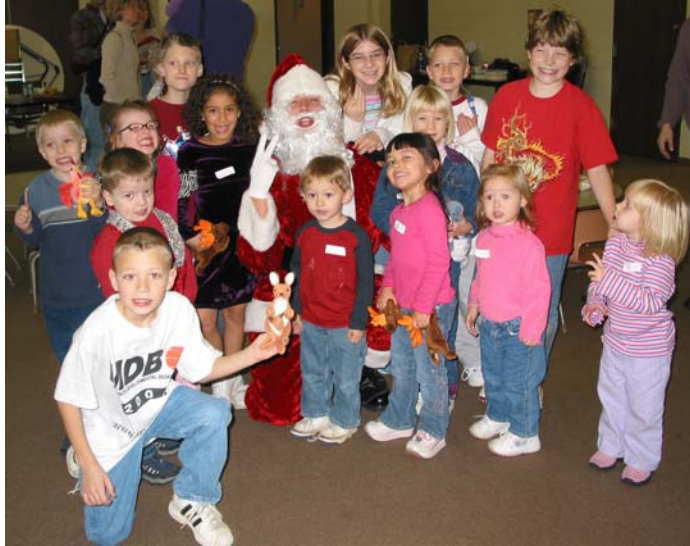
Some of the participants at CSAM's cueing Santa event.